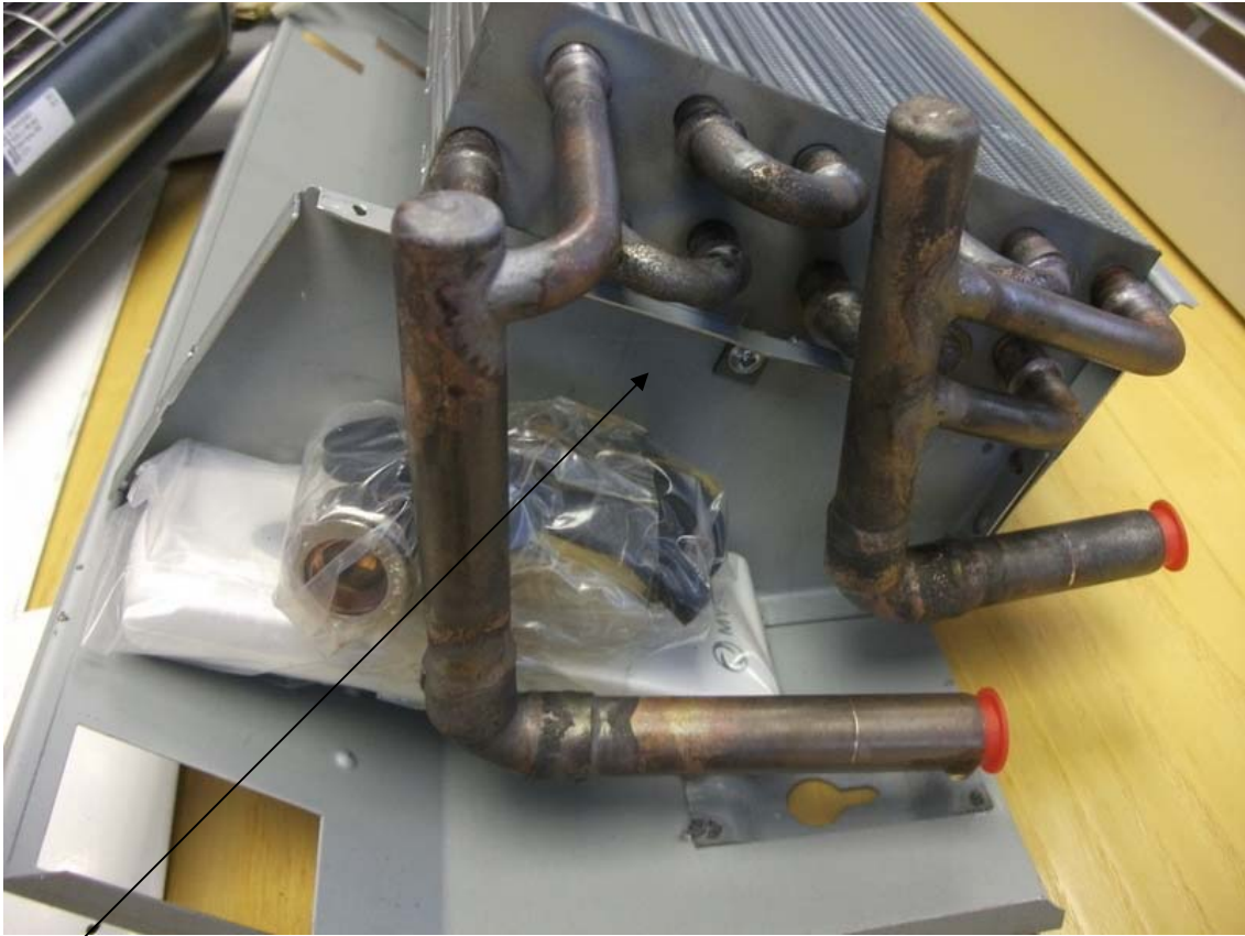
Heat exchanger retaining screw. One either end .