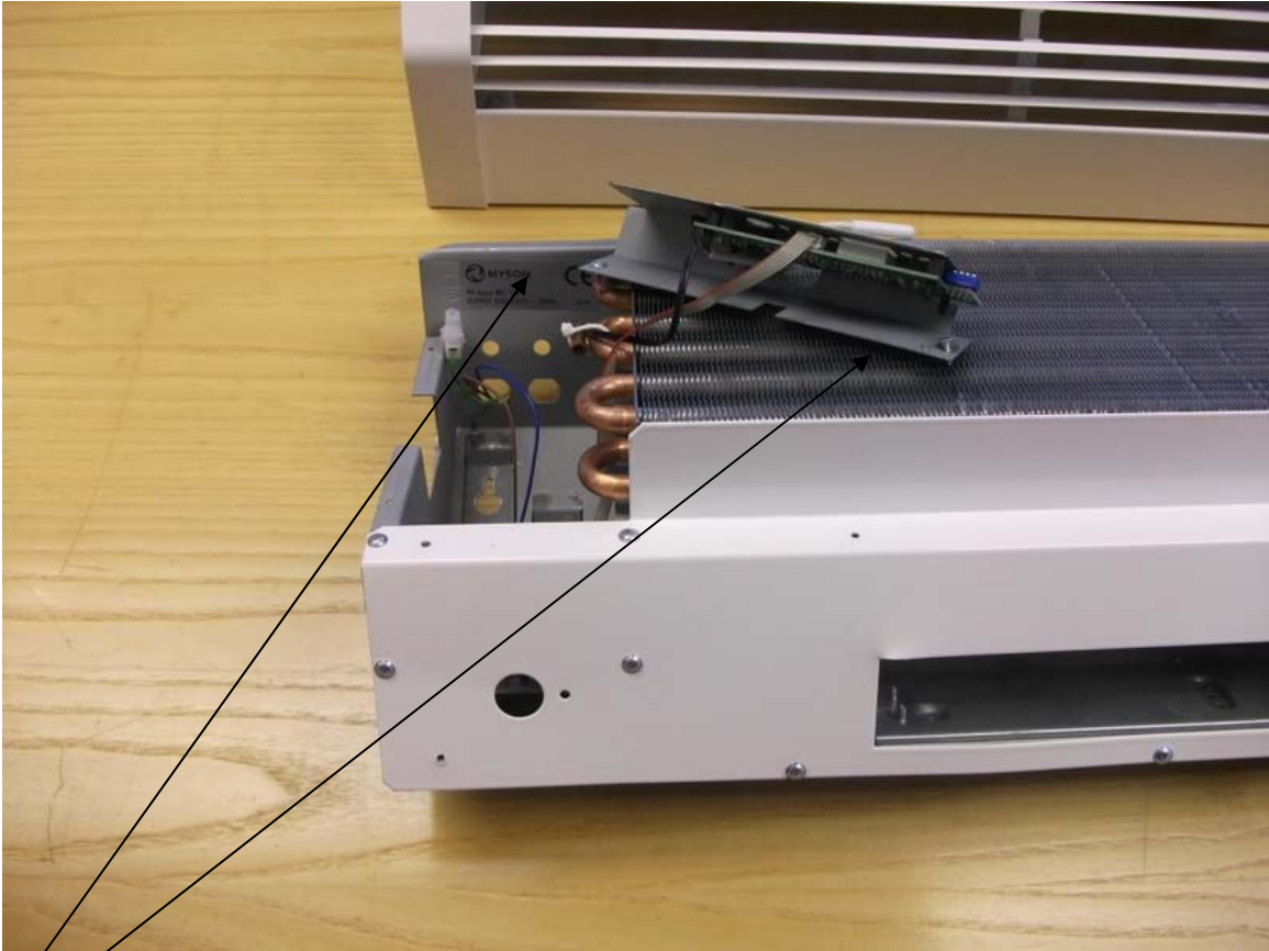
2 Screws retaining the control panel