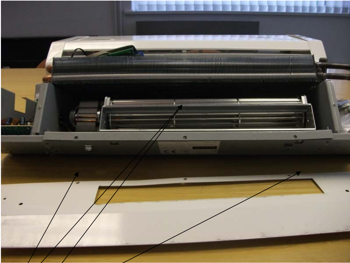
Motor tabs. Bend up slightly to release. The motor will lift out complete with the mounting plate.