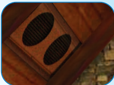
Inside view, available in white or brown.

TC1000-H Ventilator The TC1000H is the only ventilating fan designed and assembled in the USA for use in a solid roof or wall application. Perfect for A-Frame construction or for homes that don't have an attic. Two energy efficient fans move 800 cubic feet of air per minute. A motorized insulated damper seals when the fan is not in use preventing cold air, insects, and the elements from entering your home. The TC1000H is one speed, comes equipped with a wall switch, is maintenance free, carries a three year warranty and is Underwriters Laboratory approved.